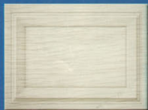
Raised Panel Woodgrain Texture

Mid-America's 2500 Series offers traditional raised panel design and beauty in the look of wood with the strength and durability of steel. 2500 Series adds classic design and striking eye appeal to any home.